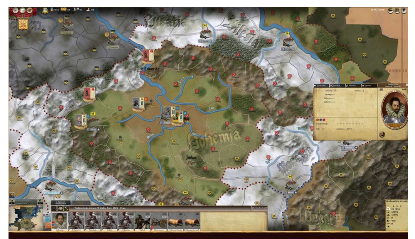
March 1624. The Emperor Ferdinand calls Wallenstein, now Generalissimo. He takes command of the Imperial Army at Prague.